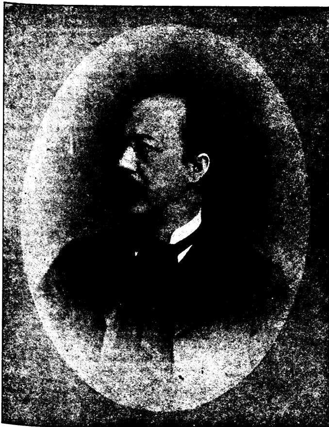
JOHN F. WOOD, Esq., M.P. DEPUTY SPEAKER OF THE HOUSE OF COMMONS.