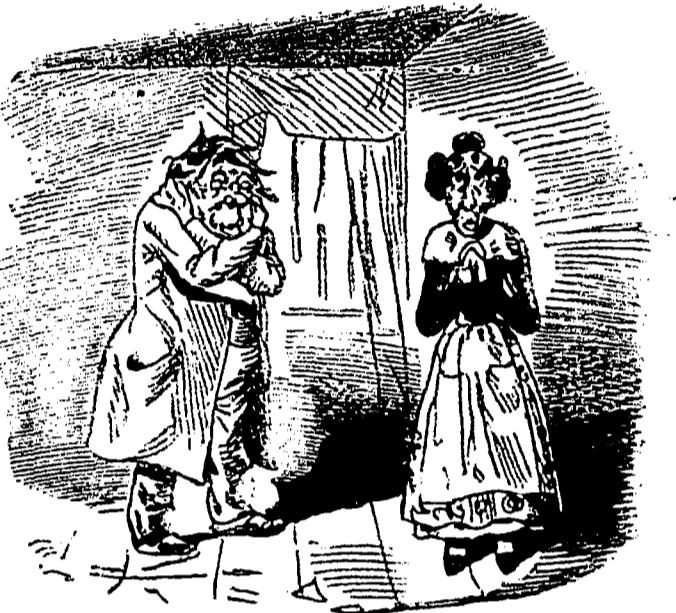
Mr. Cucumber is free! His landlady consoles him for his empty bureau drawers with the reflection that his head, though considerably enlarged, is still upon his shoulders.

Amiable Mother—"Here, Tommy, is some nice castor oil, with orange peel in it." Doctor—"Now, remember, don't give it all to Tommy; leave some for me." Tommy (who has been there before)—"Doctor's a nice man, ma; give it all to the doctor."