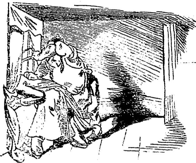
Who cuts the window grating, and