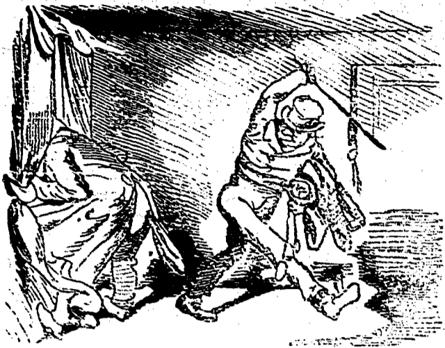
Mr. Cucumber's friend, before leaving, gives him a parting token of affection.