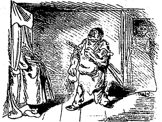
Who immediately brings a blacksmith