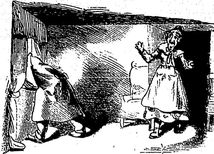
The melancholy situation of our hero, is at length discovered by his sympathising landlady.