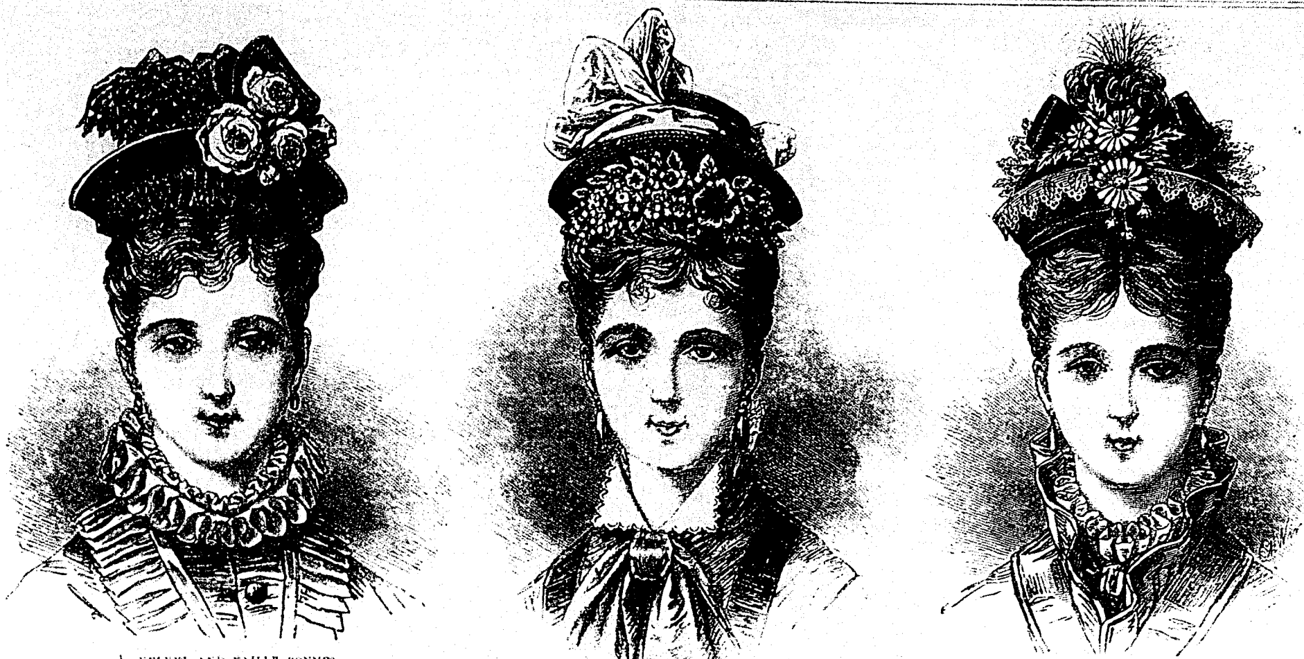
1. VELVET AND FAILLÉ BONNET.