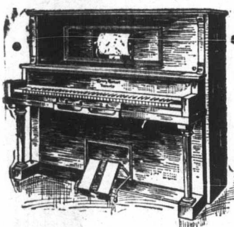
Mason & Risch Player Piano Style Henry Herbert

FULL EXHIBIT PIANOS AND PLAYER PIANOS DIRECT FROM THE FACTORY