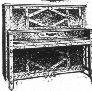
Mason &amp; Risch Style 11 Mission