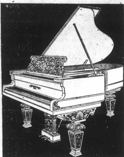
Mason &amp; Risch Grand