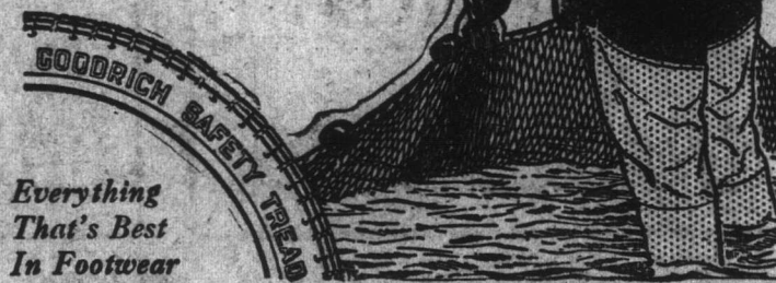
Everything That's Best In Footwear

Watch out for imitations—you can always tell the genuine by the Red Line 'round the top.