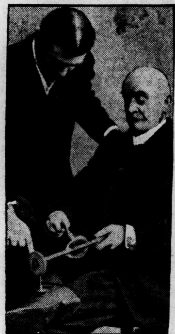
Showing a Rheumatic Sufferer how to use the Veedee.

From their successful visit to Harbor Grace and Bell Island. They will remain at Mercantile Chambers, 193 Water Street, until next Thursday, when they will leave for England.