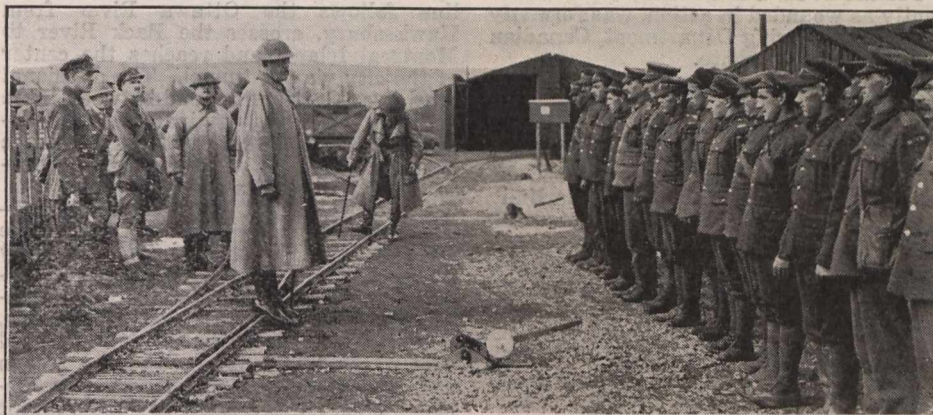
The Canadian Minister of Militia, Major General Mewburn, addressing a Canadian tramway corps near the western front.

C.P.R., Montreal, who is announced to have been made a Companion of the Order of St. Michael and St. George, in connection with war mission work, which he carried out in the western states recently, is also announced to have been specially employed and attached to the staff of the Canadian Expeditionary Force in Siberia.