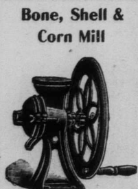
No. 750, $7.50