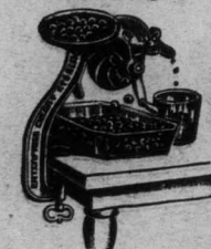
No. 1, $7.50 doz.