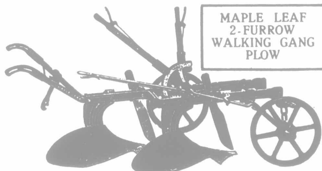
MAPLE LEAF 2-FURROW WALKING GANG PLOW

Draws only a fourth harder than a walking plow (actual test) and plows two furrows at once—needs two horses only.