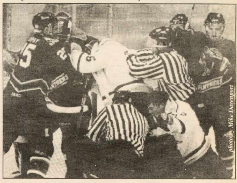
The Dalhousie Tigers show their claws.

enough to be at the bottom of the nation. The Tigers' next home game AUHC's Kelly Division, but good is on Thursday, Nov. 19 against St.