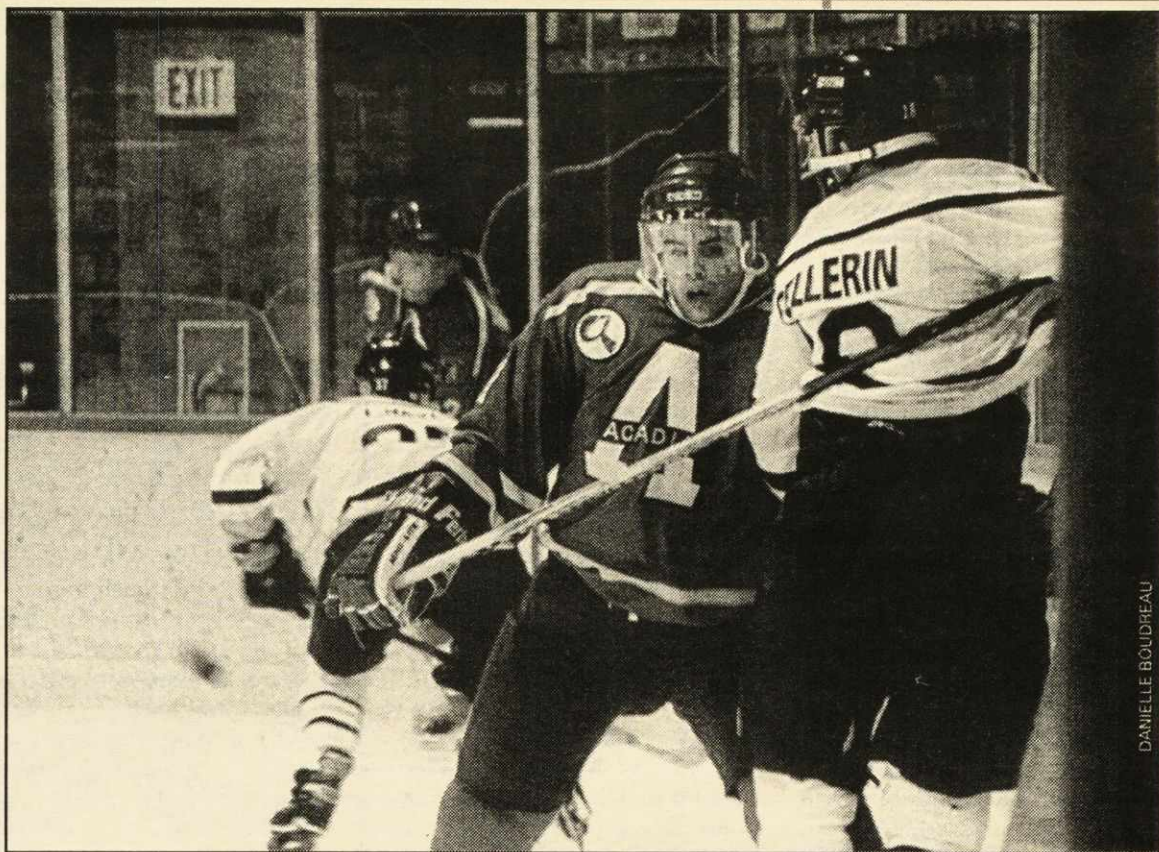
With the AUSA playoffs fast approaching, Acadia's still holding on to first place.

The Tigers now must refocus and prepare to defend their home court against hated rival UNB. The Varsity Reds are the surprise of the league at 6-5. Motivation will be easy to come by as this group looks to rebound from their first loss at Dalplex in league play since 1995.