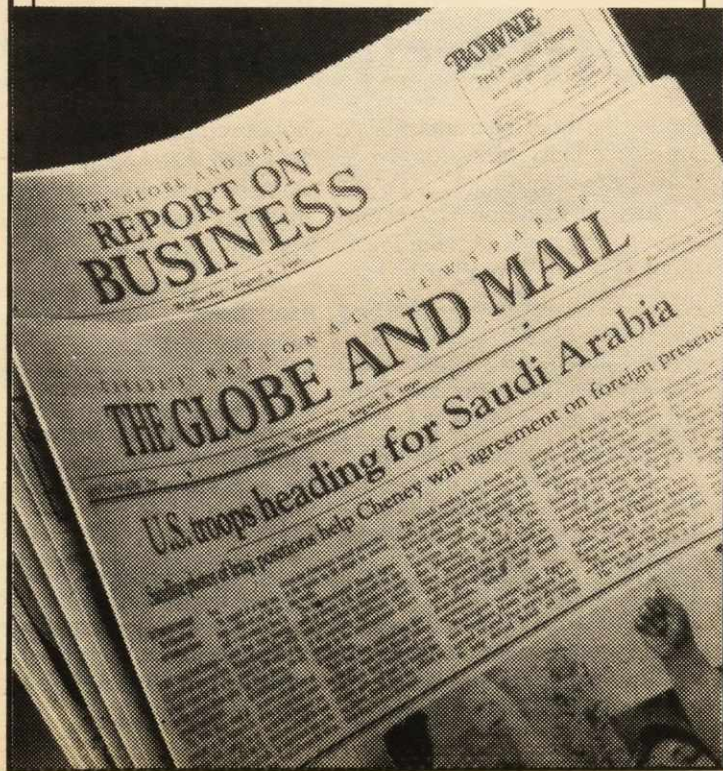
Page 4 Dalhousie Gazette