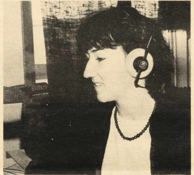
Gee, this sure beats Sony Walkman's eh? Volunteer checks on the hardware at CKDU-FM.