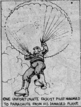
ONE UNFORTUNATE FASCIST PILOT MANAGED TO PARACHUTE FROM HIS DAMAGED PLANE