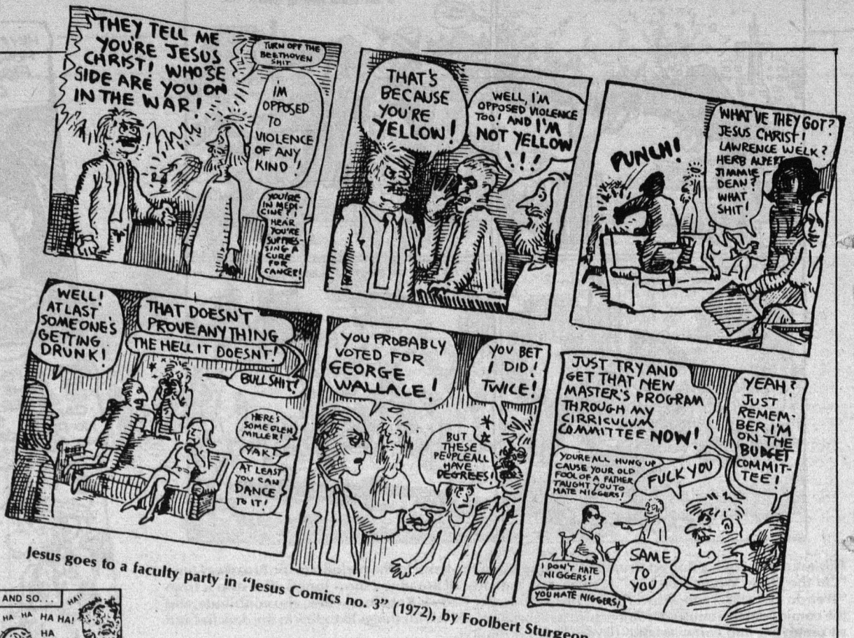
Jesus goes to a faculty party in "Jesus Comics no. 3" (1972), by Foolbert Sturgeon.

An incident from the Spanish Civil War is illustrated by Spain Rodriguez in "Anarchy Comics 1. (1978). The series presents other historical incidents like the Kronstadt mutiny, as well as analytical social dramas from a loosely "anarchist" viewpoint.