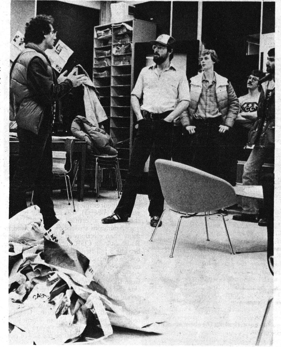
One hot afternoon we were thinking about what our lead story would be. Then it walked right in our door, in the form of a confrontation between Engineering students and anti-sexist demonstrators

To date, we still don't know what "insufficient" exactly means or how