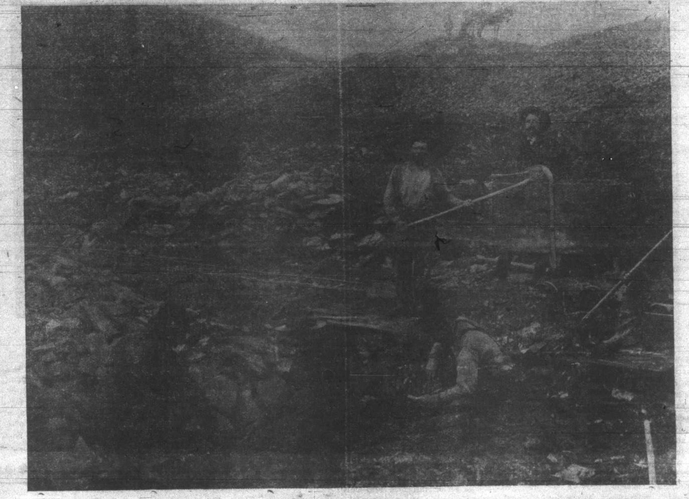
No. 2 ABOVE ON BONANZA CREEK.