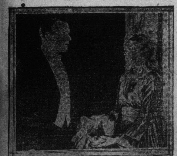
LA LITTLE BROTTIER OF THE RICH " WINVERSAL PRODUCTION EXTRAORDINARD

At imperial Theatre three days commencing Thursday.