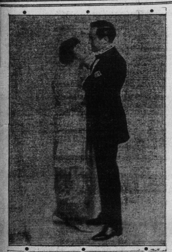
"Virtuous Men" at Imperial three days commencing Thursday.