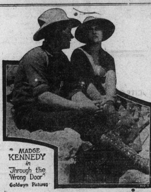
Allen Theatre Monday and Tuesday.

Allen Theatre two days, commencing Friday.