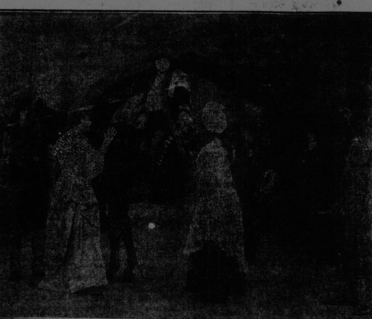
"A LADY OF QUALITY" IN FIVE REELS Famous players feature at Imperial Theatre Wednesday and Thursday. Old English story by Frances Hodgson Burnett, pictured in magnificent drama with Miss Cecelia Loftus, eminent actress, in the role of Clorinda, the hoyden.