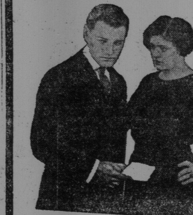
St. John People at the Sir Sam Hughes Review at Bay Shore

NO ADVANCE IN PRICES ETHEL BARRYMORE In the Delightful Stage Comedy Produced by Metro Under Ralph Ince "OUR MRS. MCCHESNEY" THE SITUATIONS ARE UNUSUAL in this sprightly comedy and Miss Barrymore is at her very best in them. She plays the role of a travelling saleswoman for a patent skirt and the amusing twists and turns of the story—by Geo. V. Hobart and Edna Ferber—keep people in stitches of laughter and tingling apprehension. "Our Mrs. McChesney" has been one of the most successful stage productions for a long time. As a film it is a riot.