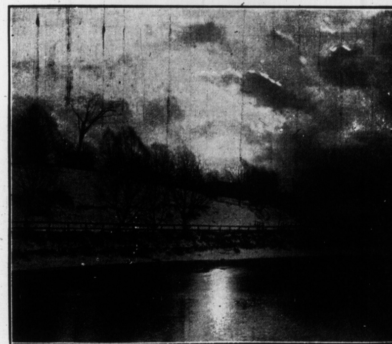
THE DAWN OF THE NEW YEAR—A SNAPSHOT OF THE DON VALLEY ON JAN. 1.

A native of Germany was visiting an American friend in New York, and the latter bethought himself to take his guest on a visit to Niagara Falls. The American, accustomed to bursts of wariness and enthusiasm, was not a little astonished to see his Teutonic friend stand and gaze stolidly minute after minute upon that roaring cataract, without evincing the faintest sign of emotion. Finally, unable any longer to conceal his chagrin and disappointment, the American turned to his companion and asked: "Don't you think that's a wonderful sight?" "Why, that gigantic body of water pouring over that lofty precipice," the German stood for a few seconds longer, until he got that idea digested, then looked up blandly and asked: "Well, 'vot's to hinder it?"—Everybody's Magazine.