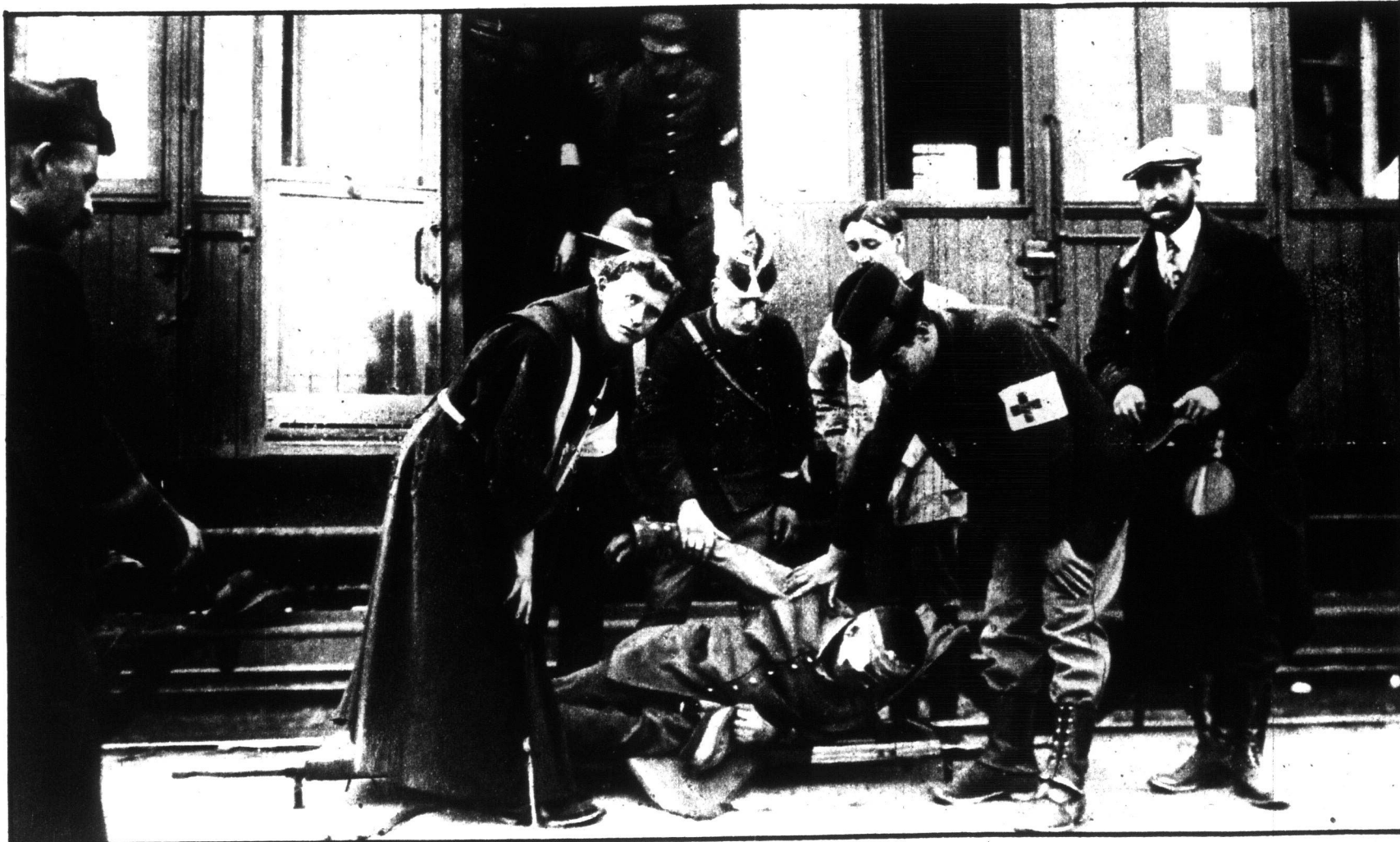
The Golden Rule on the battlefield—Belgians caring for German wounded. In the background is one of the railway coach ambulances in use in Belgium, France and England. This kodak shot was made near the French frontier.