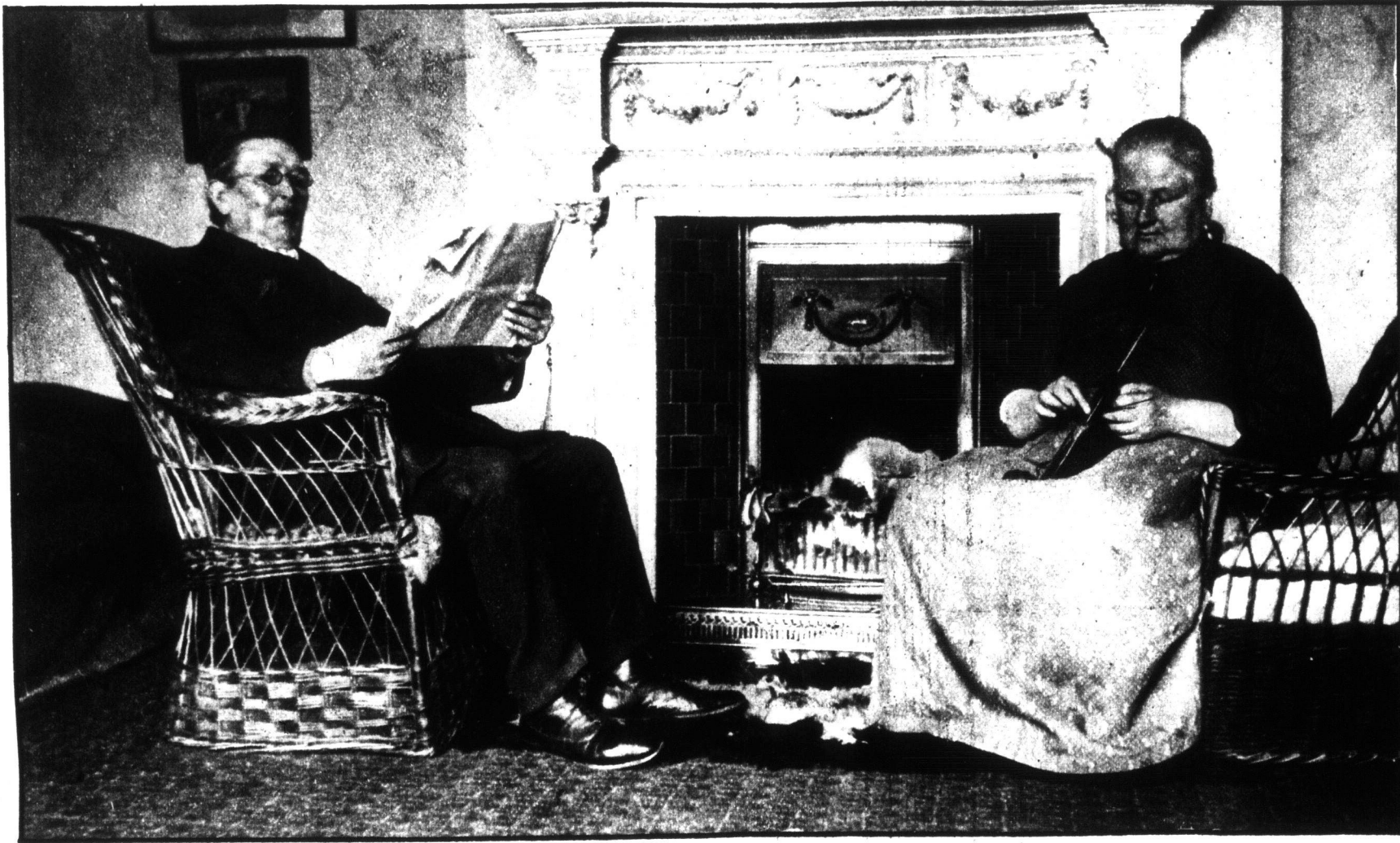
Belgium refugees enjoying the comfort of an English fireside. Thousands have been given such homes as this in England.