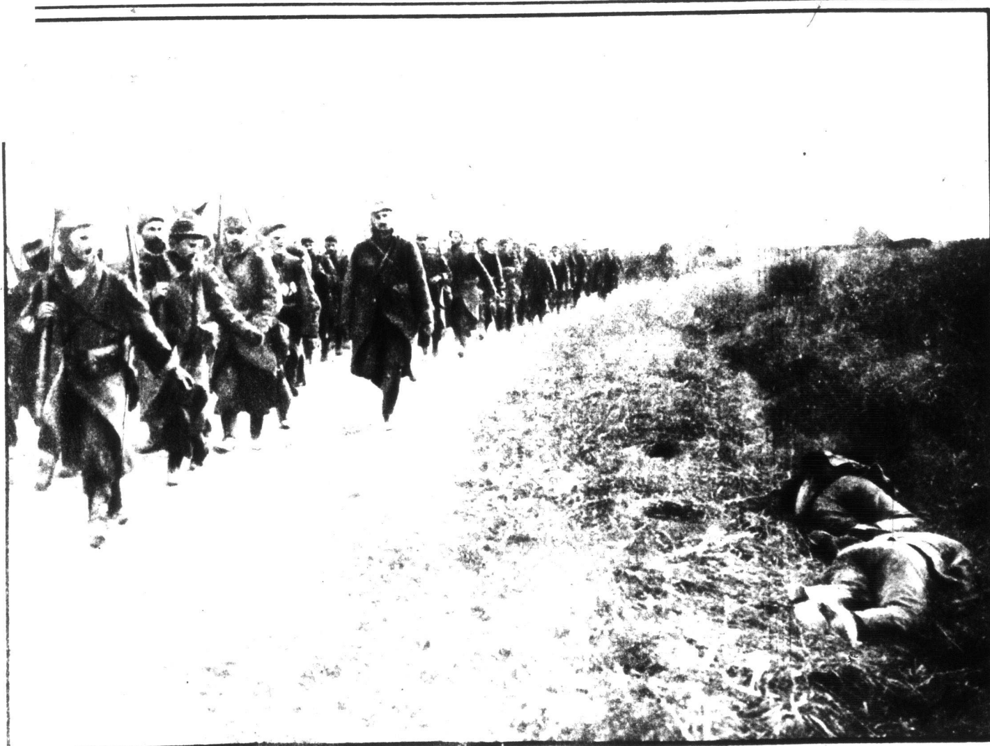
French reinforcements passing German dead near the Aisne. Notice the gestures of the men as they go by.