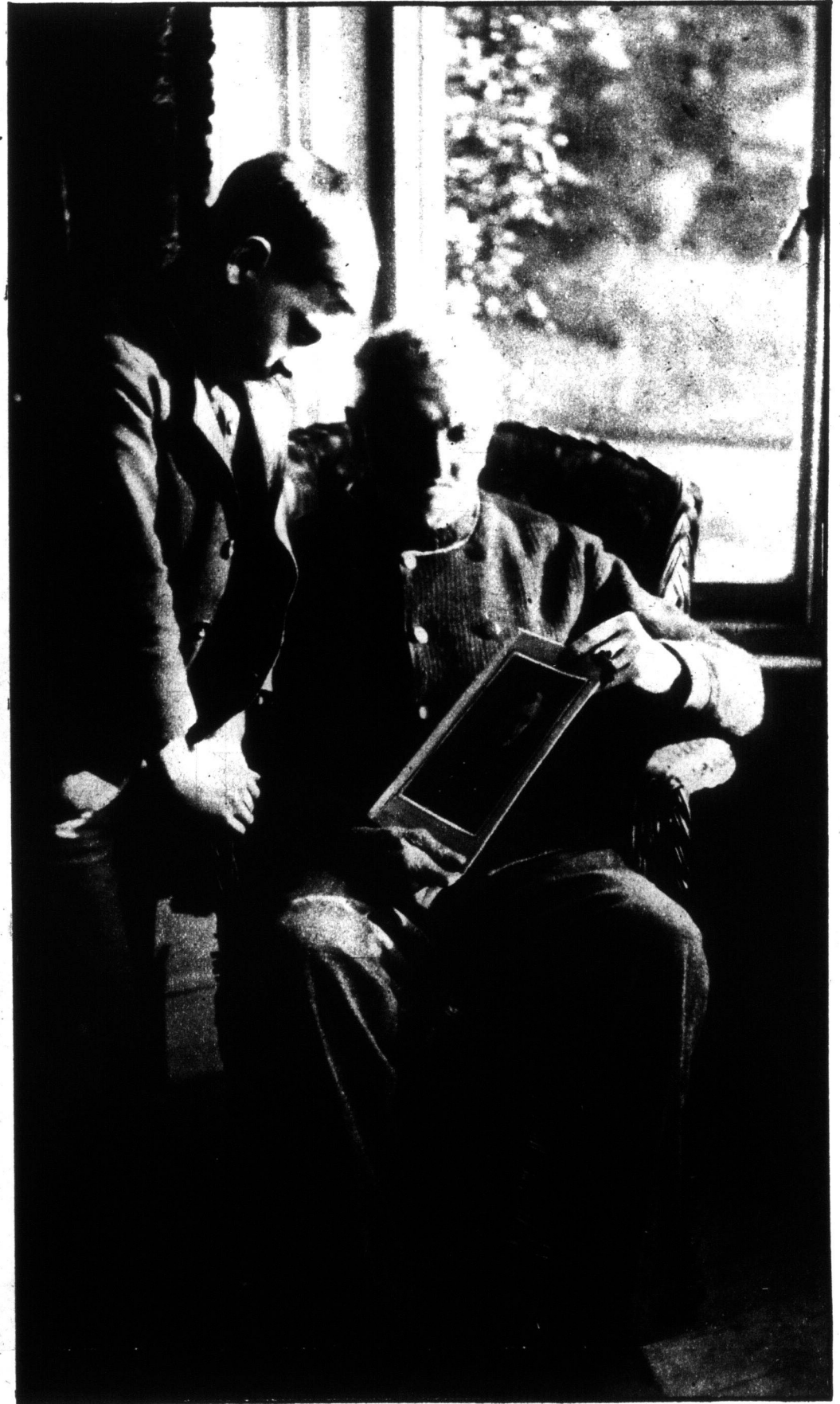
An old Belgian showing his grandson a picture of King Albert, whom his people dearly love. Not in many generations has a sovereign taken such a sure place in the heart of a nation and of the world at large, and under such tragic conditions.