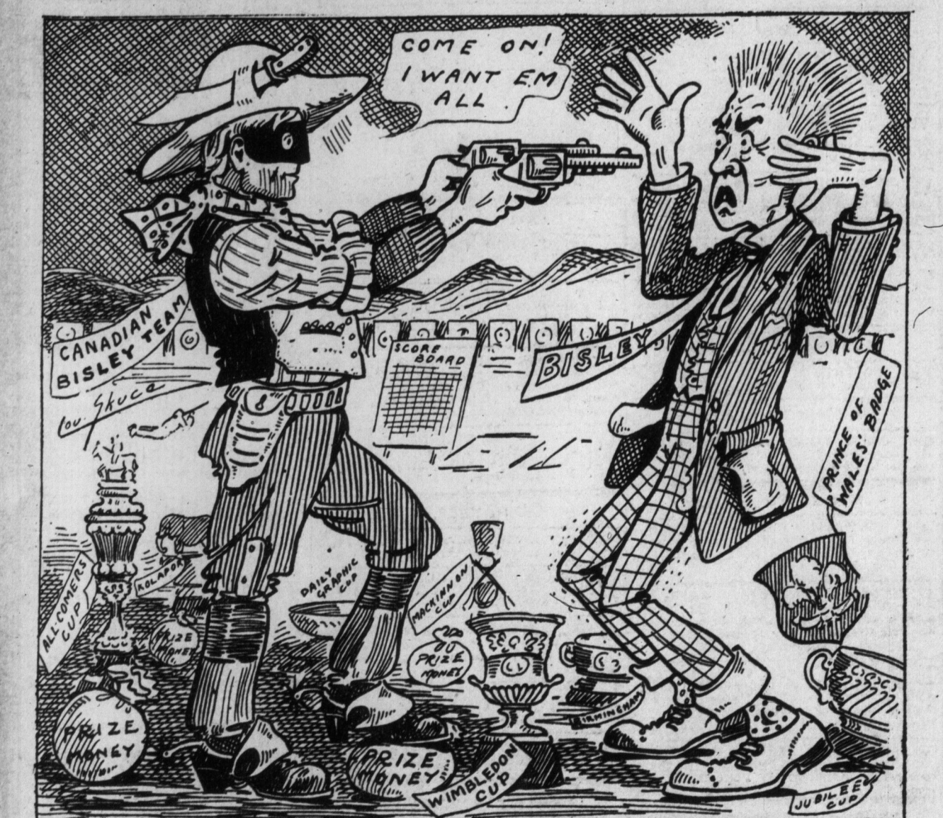
MR. BISLEY MEETS A BOLD, BAD MAN

Gold Filled Supports, Filled and Sterling etc. Regu- white lustr, ar 50c. Fri- with assort, gold filled day Rings, bargain 50c. to box, good ex. ar 10c per ular 40c per .85 .85 $ for 1.00 .20 .15 m. .60 .149 .49 this useful sock, $1.50; 50c.