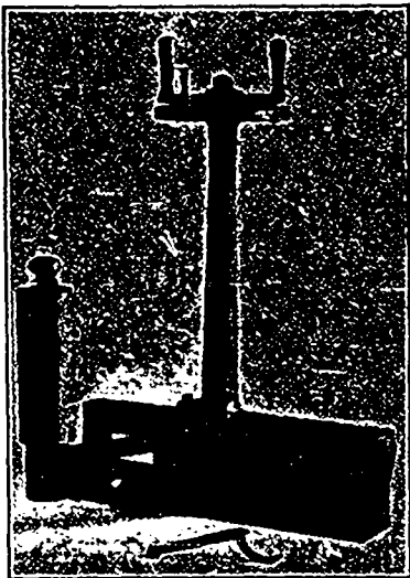
IMPROVED FAIRBANKS ROLLER GAUGE.

Embodies all of the Advance Features of the heavier sizes. It is Light, Rigid and Durable. The carriage excels for handling long timber—can't cut anything but parallel with it, unless you want to.