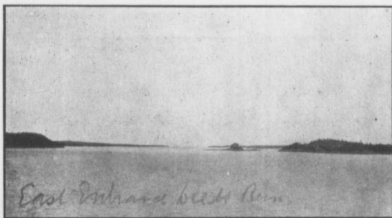
ANOTHER VIEW OF DILDO RUN

As for Mr. Coaker, his works speak for him. To the men who stood by him, when he came from the obscurity of his northern home, he is the same "Coaker"; the same determination and grit is there; the same indomitable character. The cares of responsibility have laid, apparent-