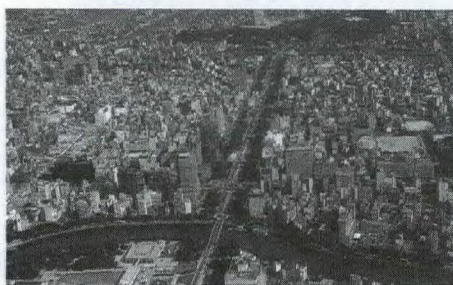
Aerial view of Hiroshima

to concentrate on Tokyo and Osaka but there are advantages to a more regional approach in expanding existing business in Japan, or to enter the market for the first time. Hiroshima, an often overlooked city in the Chugoku region of southern Japan, is an exciting centre of opportunity outside of the capital.