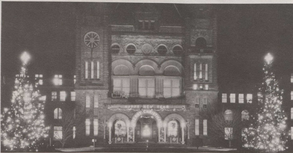
The parliament buildings in Toronto, Ontario, decorated with Noma lights.