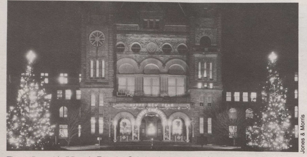
The parliament buildings in Toronto, Ontario, decorated with Noma lights.

Company officials expect a new era in the development of Noma's international business not only for Christmas products but for others in the diversified range of consumer products manufactured by the Noma group.