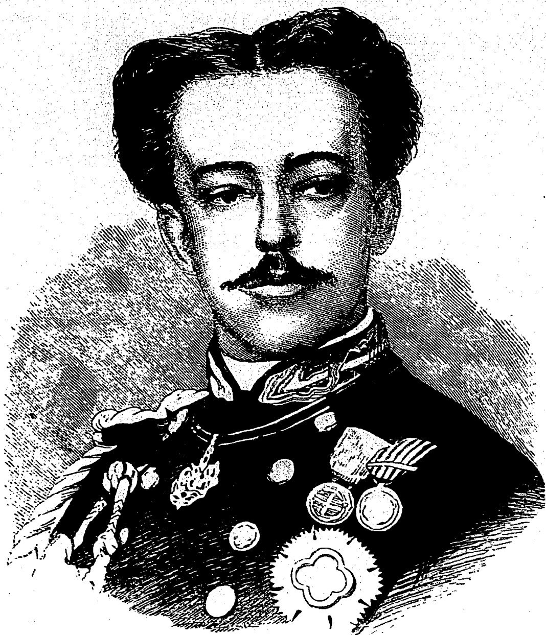
THE DUKE OF AOSTA, KING OF SPAIN.