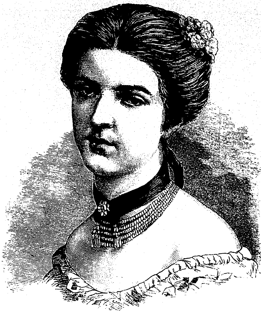
THE DUCHESS OF AOSTA.