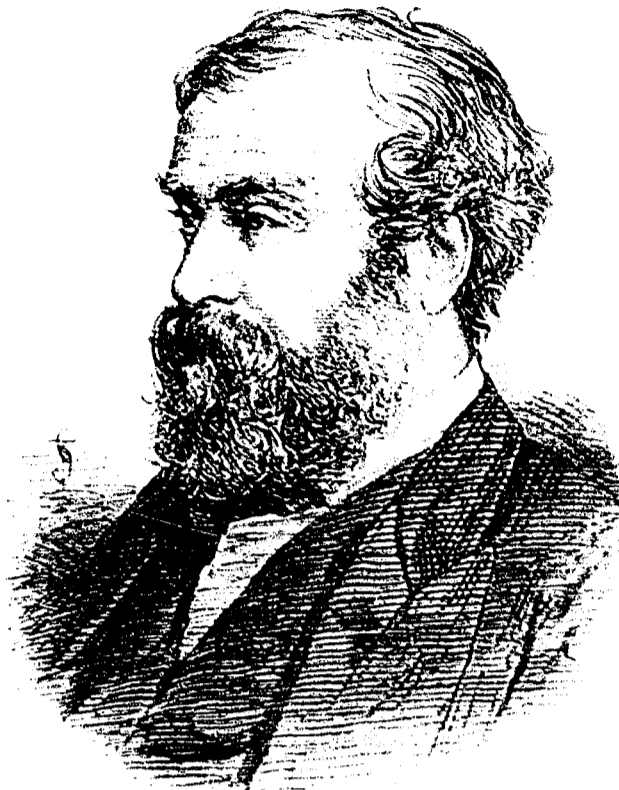
THE LATE WILLIAM HARRISON AINSWORTH.