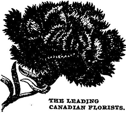
THE LEADING CANADIAN FLORISTS.