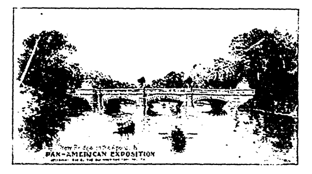
FIG. 2146. THE BRIDGE OF THE THREE AMERICAS.

Simon's plum, quite ripe; Red June, small,