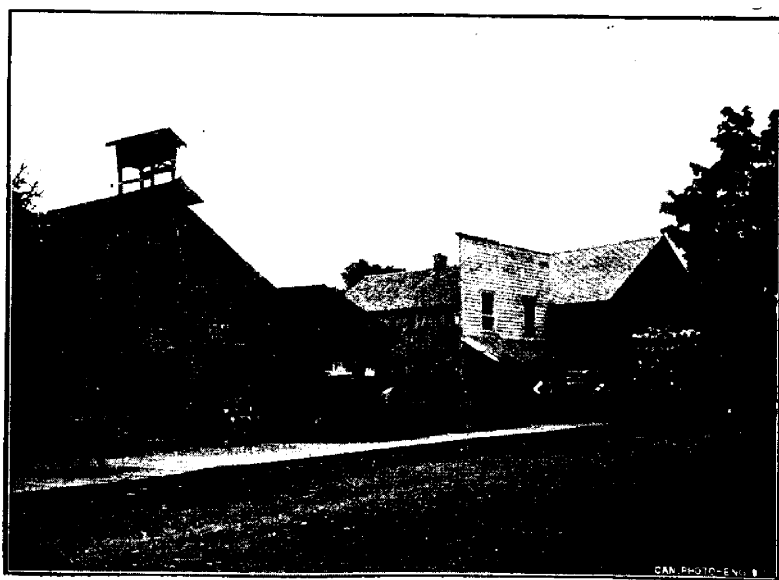
FIG. 1089.—BASKET FACTORY, GRIMSBY.

chards and nursery stock. A great variety of fruit 1 is grown, including peaches, pears, plums, grapes, quinces, apples, cherries, raspberries, blackber-