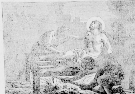
SPECIMEN ILLUSTRATION—THE MARYTDOM OF ST. LAWRENCE.