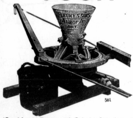
'Good Luck' Power with Grinder Attachment

As a power for driving any machinery with two or four horses the "GOOD LUCK" Triple Geared Power is unequalled. The above machine, set up with Arms and Tumbling Rod ready for horses and to drive another machine by rod direct, will be found one of the best time savers and effective dual-purpose machines now in use. The construction and finish are perfect. Thousands of them are now in active service and giving the highest satisfaction. A machine of highest capability.