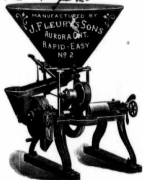
Fleury's "No. 2 Rapid Easy."

The "No. 2 Rapid Easy" with 10-inch plates, and its SOLID FRAME or BED, is not only an extremely handsome looking machine but the character of its work and its great capacity make it one of the best "paying guests" on the farm. Feed trough is long and broad giving feeding and screening capacity equal to the rapid work of the grinder. Heavy steel shaft with long bearings and heavy balance wheel. Rigid and durable, this machine is especially fitted for fast running and heavy work.