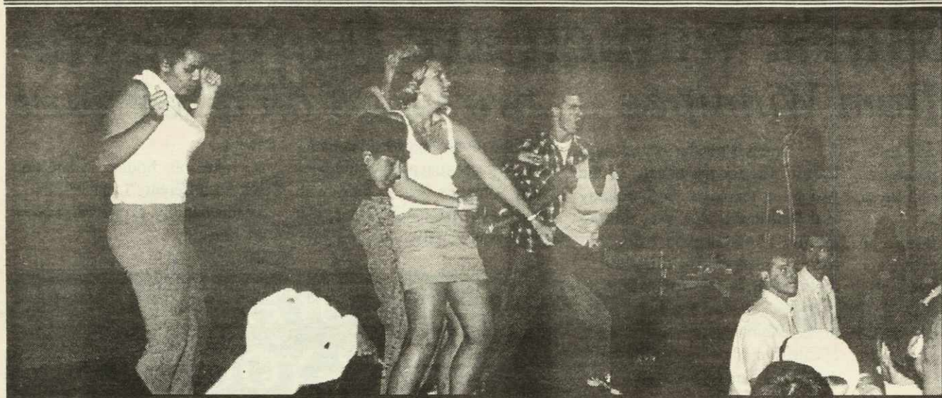
"Excuse me, is that your ass I'm bumping into?" "Why yes, yes it is."