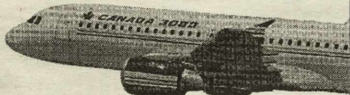
Canada's most modern aircraft fleet!