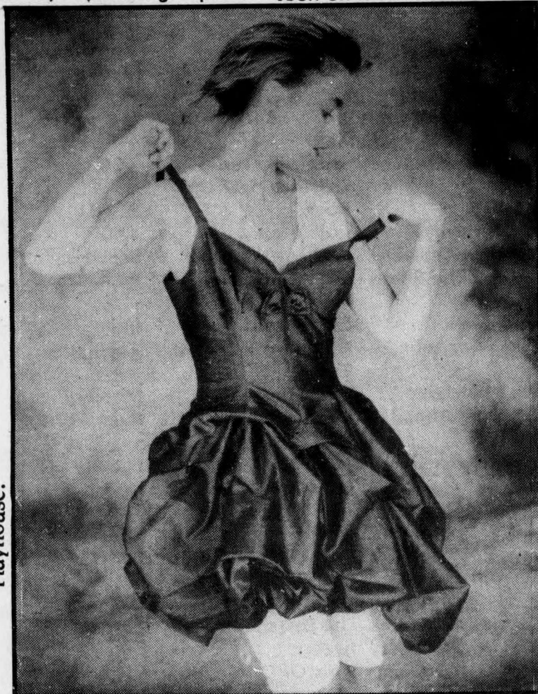
Jane bares her shoulders and lungs at our very own Playhouse.