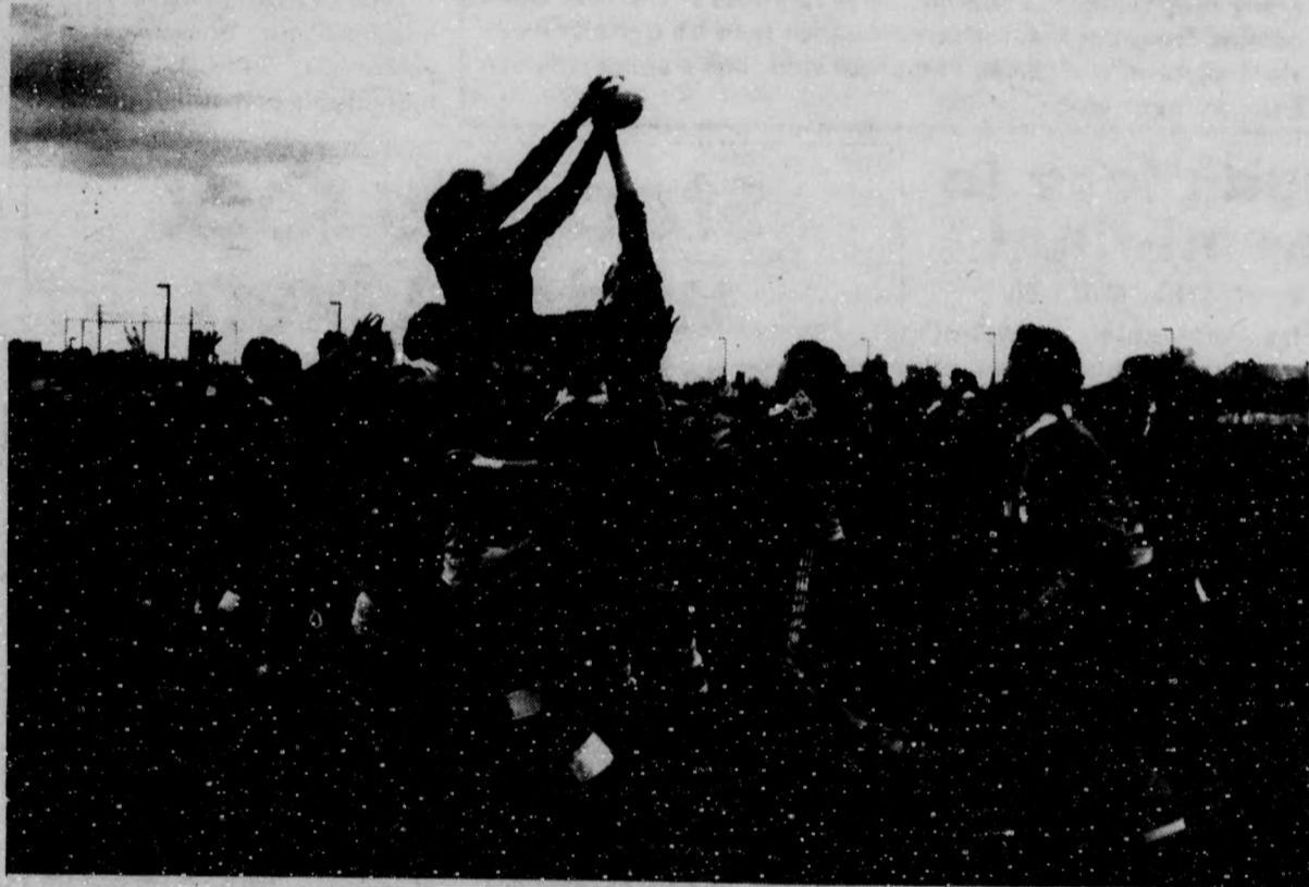
Women's rugby from Boston trip