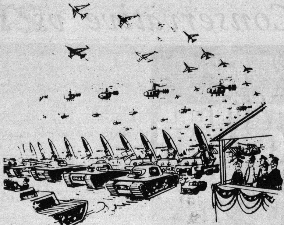
'You call that a pitiful, helpless giant?'

For applications and/or information, contact the Students' Union Executive Offices, Room 259 Students' Union Building, 432-4236.