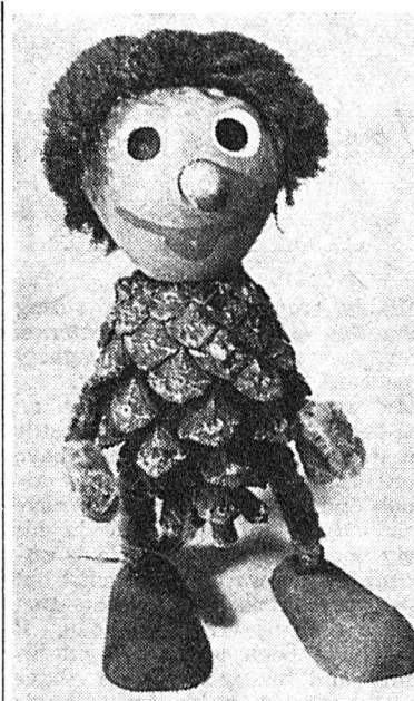
DADDY DAVE DOLL: available at Treasure Van.

Further information can be obtained from the Student Awards Office or from the NFCUS office in SUB. The University of Alberta may select three exchange scholars, but there is a possibility that more scholarships could be granted if there were great enough demand from suitable candidates.