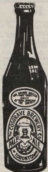
As light as lager, but better for you.