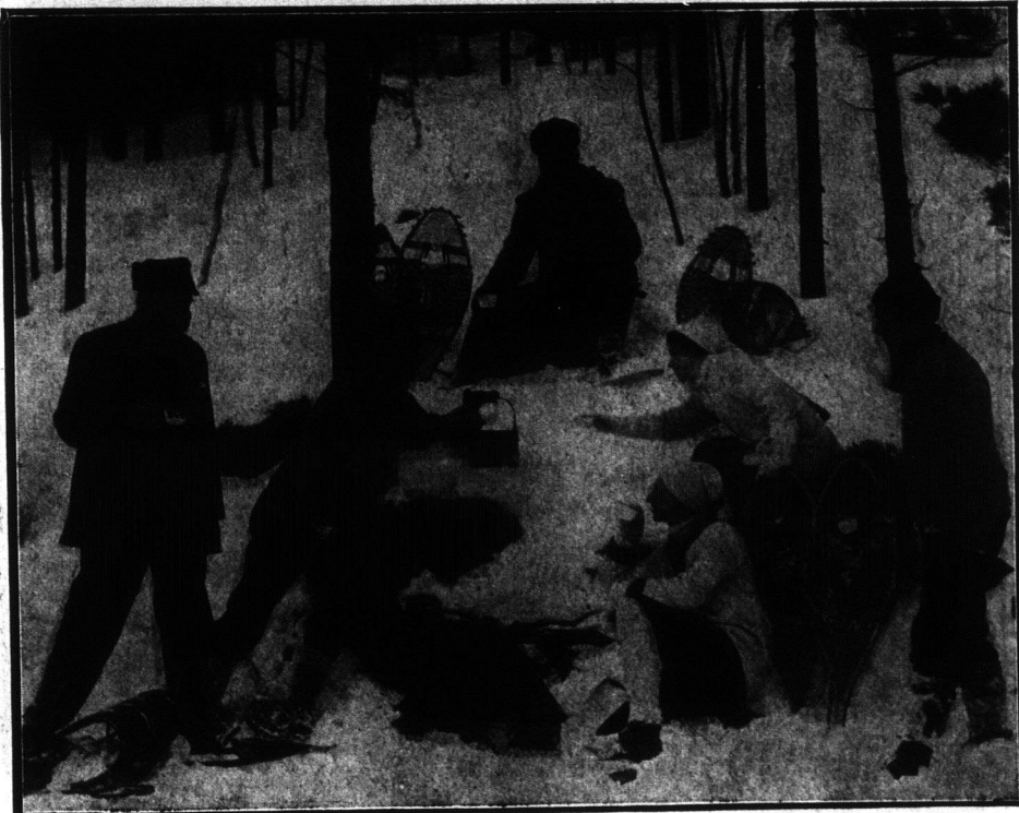
Snowed out of a party at lunch

Dear Editor: I am, as I suppose you are aware of the fact, behind in my rates, so please accept $1.50 for further good faith, and I would very much like to say a few words with regard to "Plato." I am a western bachelor to start with, and I would not take up a pen to try and defend my title. I never was aware of the fact that this is a land of woman hunters. I came from the East myself, and presume that most of the western bachelors "Plato" speaks of did also. Now, "Plato," we have friends in the East, and we do not necessarily have to grab the first spinster we see out on the prairie. We have seen ladies before, although we may meet the one that is intended for us right here, and our union might be as happy as though it was pulled off in Sunny Italy. No, "Plato," I do think you are mistaken. I have spent several years in the West now, and formed the acquaintance of a great number of western bachelors, and I can say that those who have married are living happily, and I also do think that their wives rank as high in their estimation as any one I know of. As this is a fair sized old world, I cannot see why "Plato" should class the western bachelors by them-