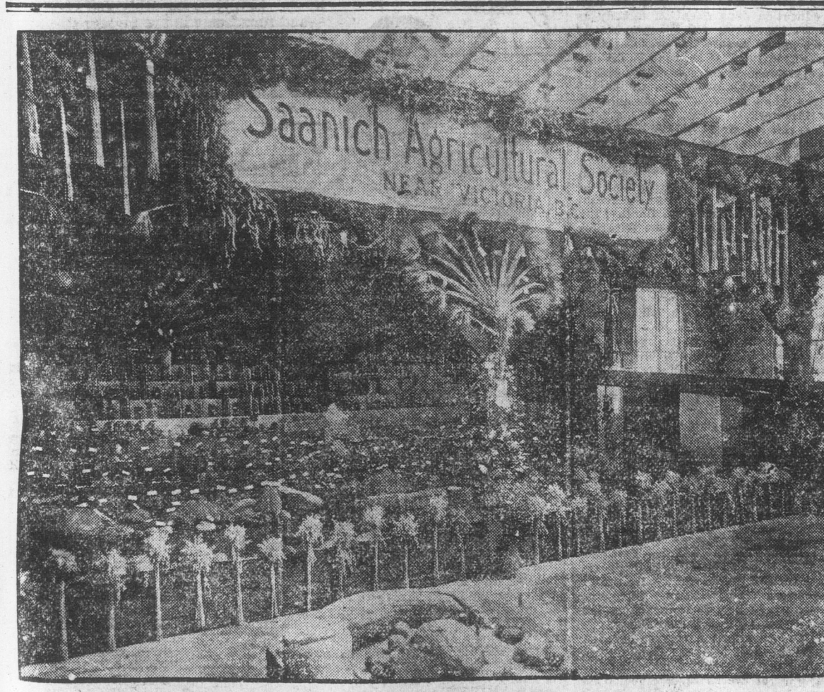
THE SAANICH EXHIBIT AT THE WESTMINSTER FAIR.

This splendid object lesson which the farmers of the peninsula gave visitors to the Dominion Exhibition, of the fertility of their district.