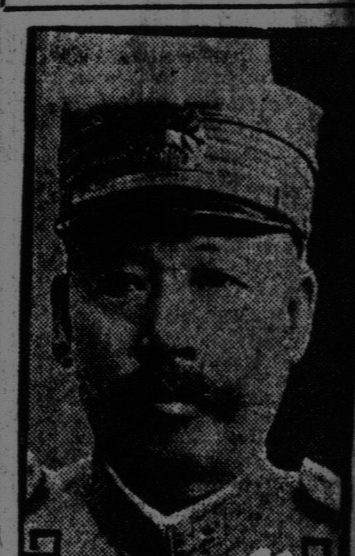
President Tsoo Kun, of the Peking Government, who has denounced General Lu Yung-Hsiang, Governor of Chekiang and leader of the forces which are attacking Shanghai.