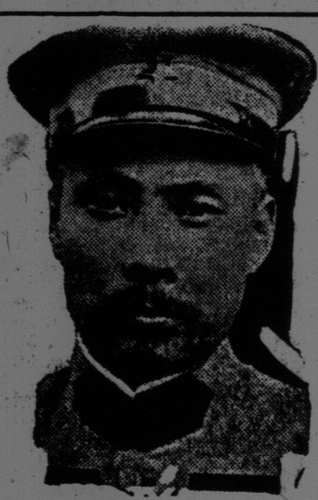
Marshal Chang Tso Lin, Manchurian war lord, who is supporting General Lu Yung-Hsiang, Governor of Chekiang and leader of the forces which are attacking Shanghai.