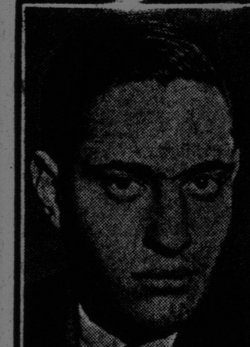
Richard Loeb (right) and Nathan Leopold, Jr., (left), who this morning were sentenced by Judge John R. Caverly in Chicago to life imprisonment for the murder of Bobby Franks, 14 years old. They each received also a sentence of 99 years on the charge of kidnaping for ransom, to which both of them pleaded guilty.