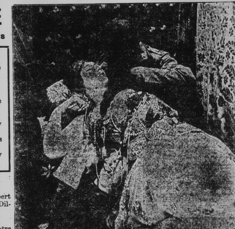
Scene from "The Darling of Paris"

ONE OF MANY FEATURES-The Celebrated Notre Dame Cathedral is faithfully reproduced in "The Darling of Paris."