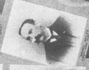
HENRY BILLS PRESIDENT OF THE COUNCIL