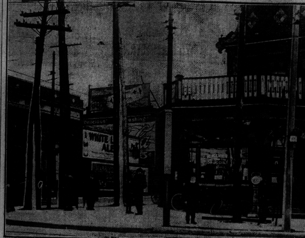
This photograph shows some of the poles at the junction of King and Queen streets at Sunnyside. or three more have been put up since the picture was taken.