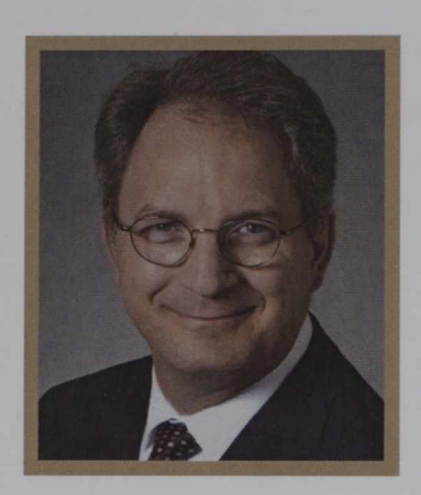
Gérald Cossette Associate Deputy Minister, Foreign Affairs