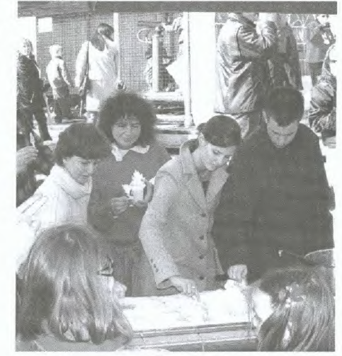
Sampling maple taffy at the Canada Booth

involvement was the result of extensive preparations and networking in Ottawa, Montreal, Toronto and more recently Vancouver by the Department working with Baltic embassies in Canada.