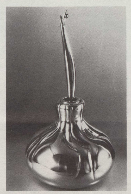
Ink bottle with stopper, 15 centimetres high.