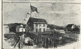
Telegraph office at Heart's Content.